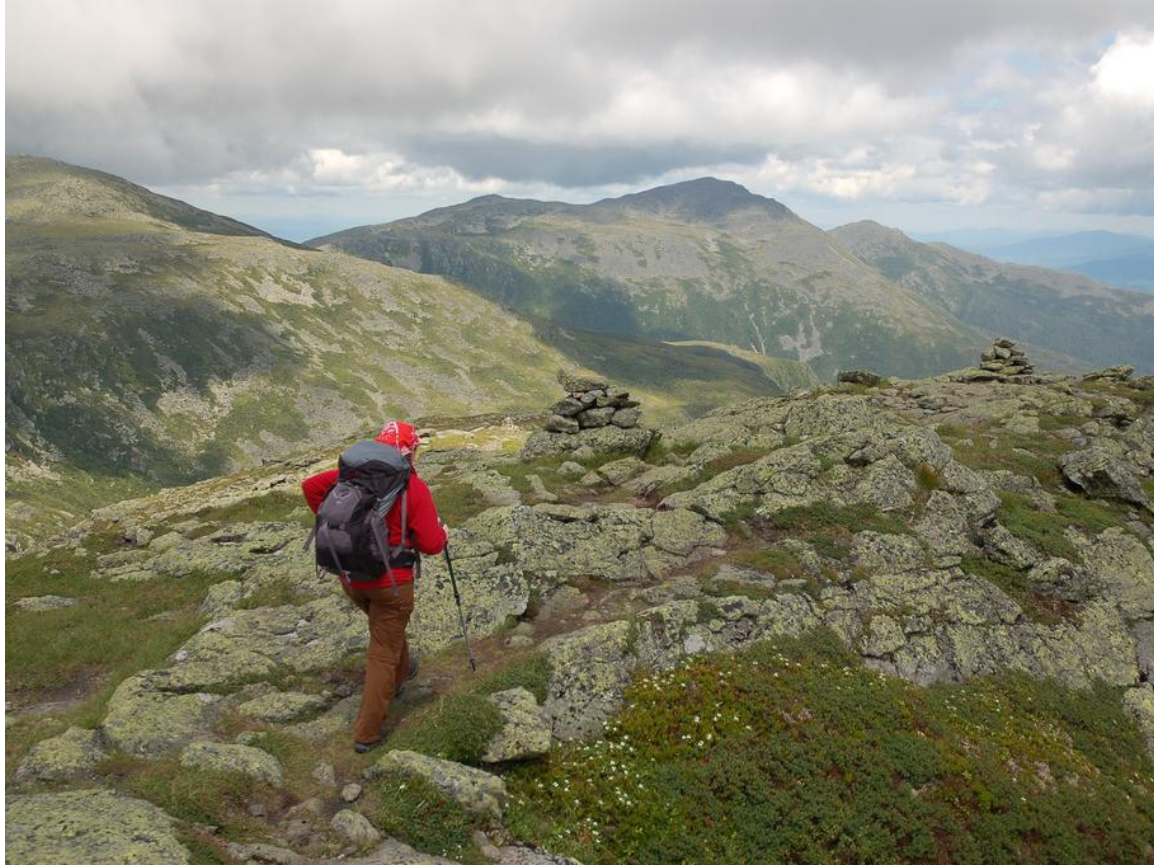
Along the Trail