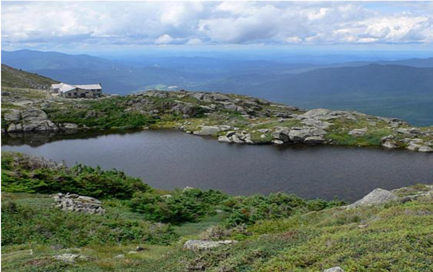
Lakes of the Clouds Hut