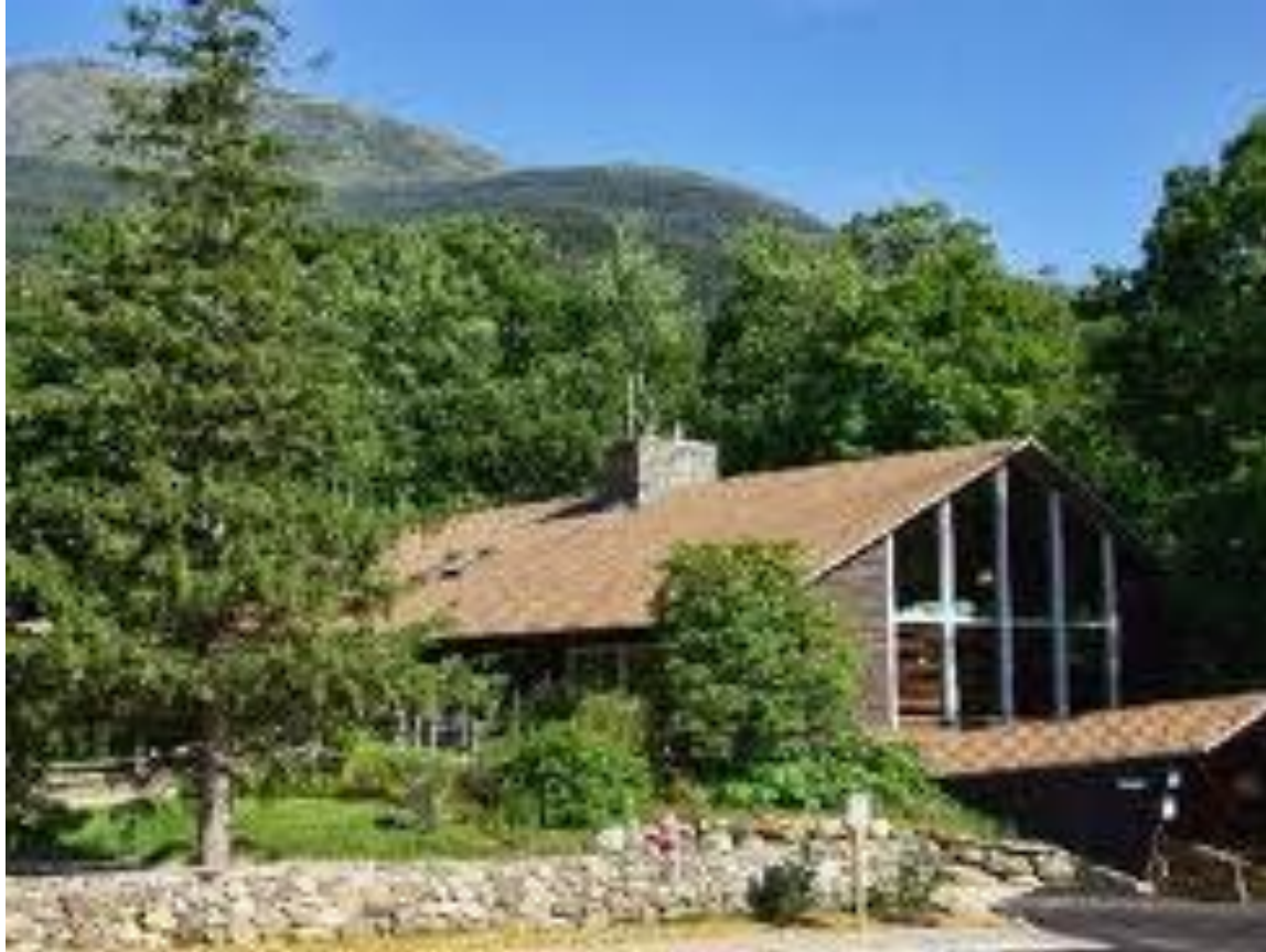
Joe Dodge Lodge – Pinkham Notch