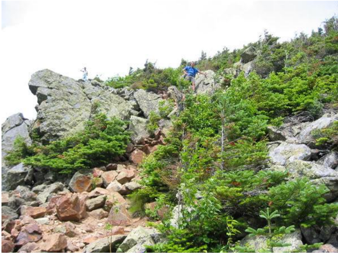
Webster Cliff Trail