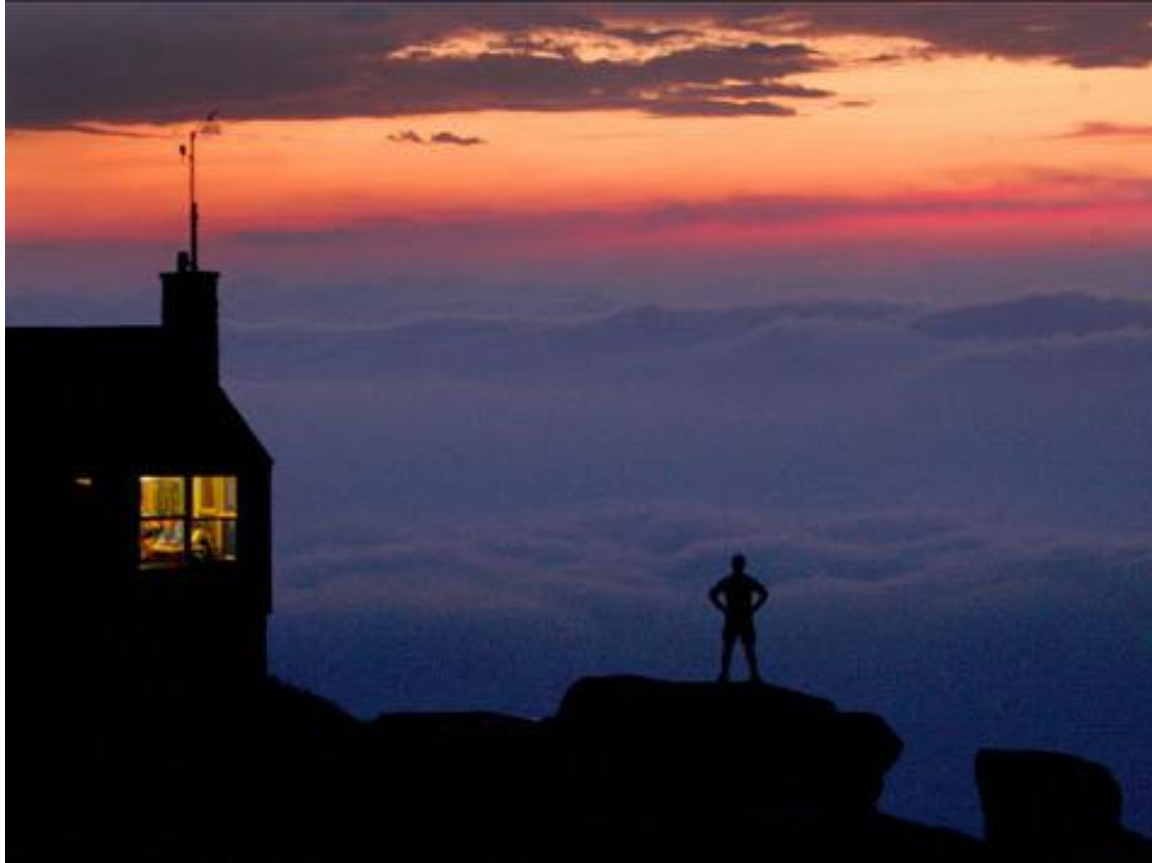
Sunset at Lakes